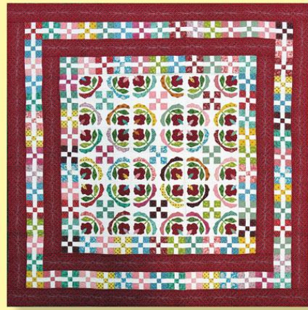
"MEADOW LILY" 2023 RAFFLE QUILT TICKETS AVAILABLE