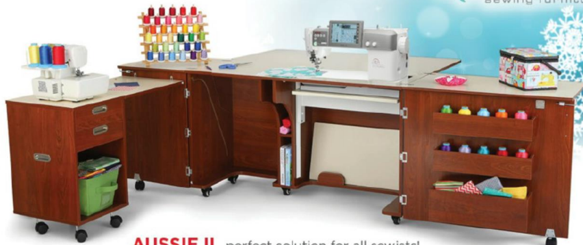
AUSIE II perfect solution for all sewists!