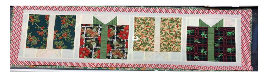
Kathy Webster Table Topper