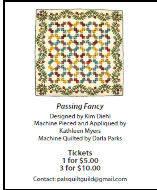
Quilt